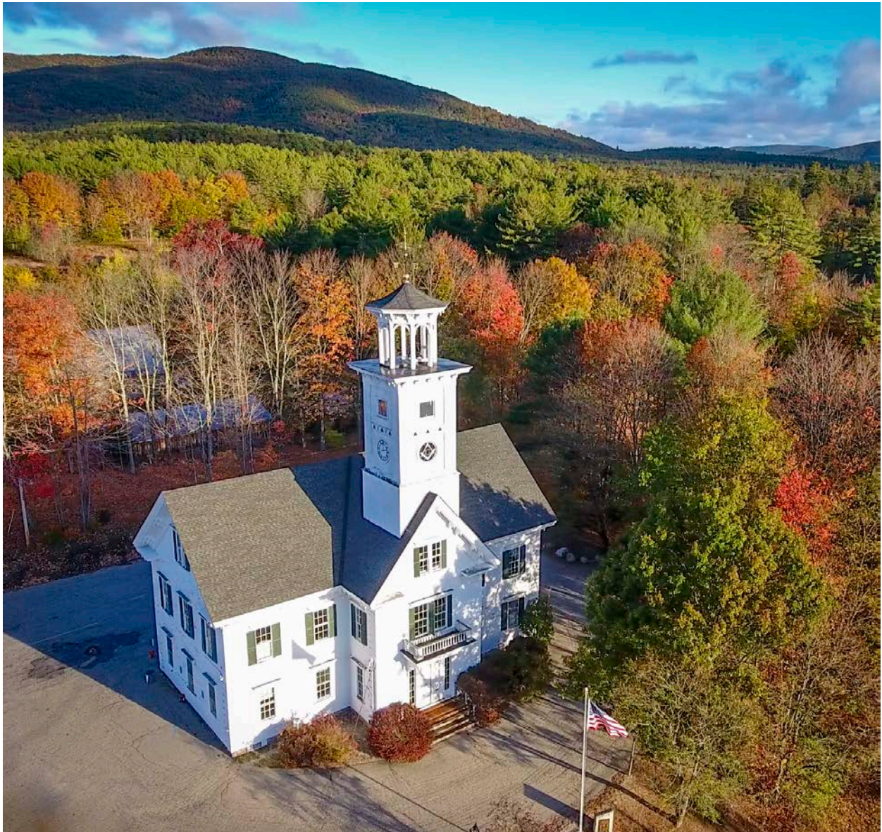
Effingham Public Library - Historic Town Hall