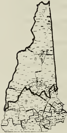
Towns in Council District #1