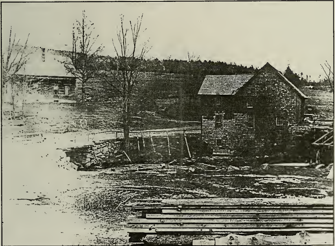
Colcord Mill circa 1890's

for the fiscal year ending December 31, 1997